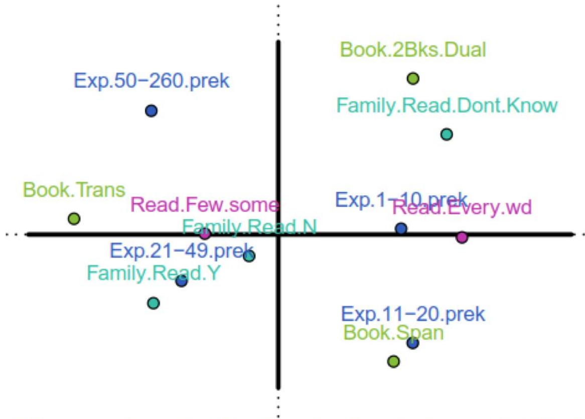
Figure 1. Multiple correspondence analysis of the active variables. The horizontal axis explains 66.43% of the variance. The vertical axis explains 24.26% of the variance. Dark blue = experience; magenta = SLPs' reading behavior; cyan = family read; lime green = book type.